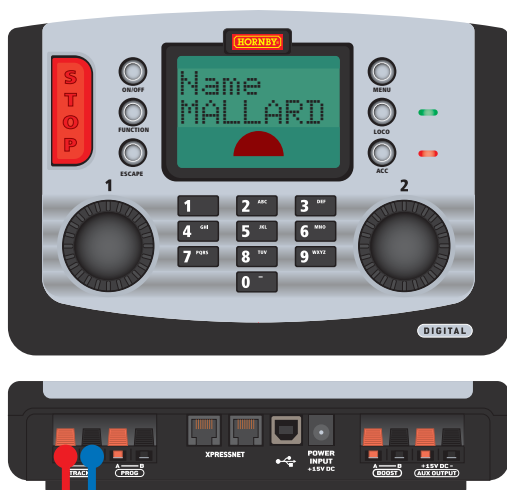
DCC Control System