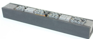
SVC-440 - 440mm Servicing Cradle UK RRP only £17.95