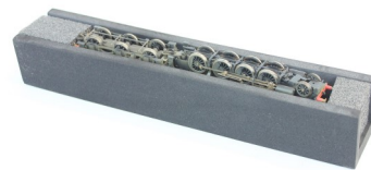
SVC-340 - 340mm Servicing Cradle UK RRP only £16.95