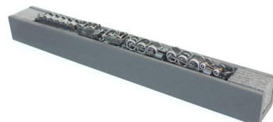
SVC-540 - 540mm Servicing Cradle UK RRP only £18.95